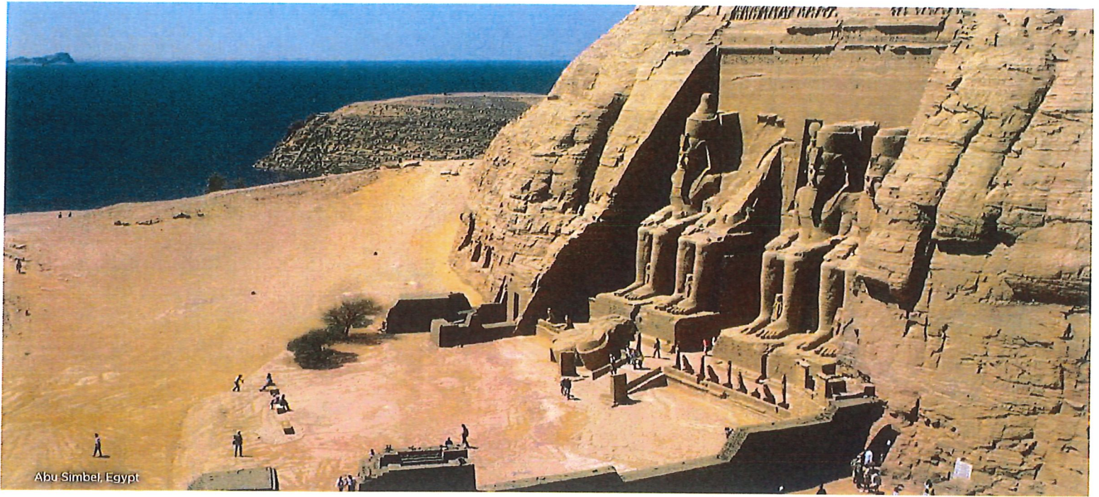
Abu Simbel, Egypt