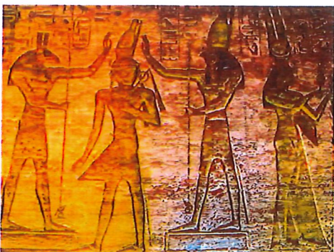
Stone carvings, Temple of Abu Simbel

Buried for years in the sand until being discovered in 1813, the temple was built along the banks of the Nile River and had to be moved with the creation of the Aswan High Dam. In a remarkable feat of engineering, the temple complex was dismantled in 1960 and rebuilt on a higher hill in Lake Nasser, one of the largest manmade reservoirs in the world.