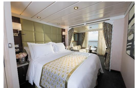
Deluxe Veranda Suite

As space is limited, please contact us today! 800-266-3359 / 805-927-4696 diana@sstraveler.com , john@sstraveler.com , london@sstraveler.com , rebecca@sstraveler.com